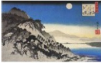
Niebla matinal sobre una montaña sin nombre