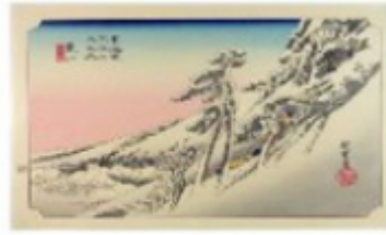
Vestido de escarcha cubierto de viento un niño abandonado

In German Romantic painting, particularly that of Caspar David Friedrich, we find this idea of atmosphere, not only on a physical level (of the landscape) but also on a spiritual level (Romanticism itself); the subject is suspended in an atmosphere.