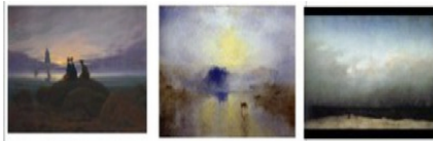
Sunset over the Sea, 1822 Northam Castle, Sunrise, 1845 Monk on the Seashore, painting

In German Romantic painting, particularly that of Caspar David Friedrich, we find this idea of atmosphere, not only on a physical level (of the landscape) but also on a spiritual level (Romanticism itself); the subject is suspended in an atmosphere.